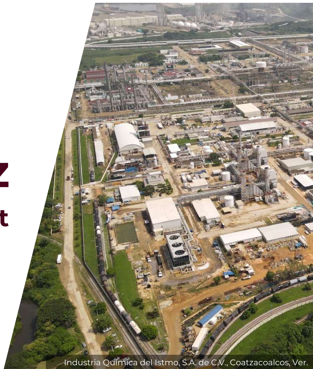
Industria Química del Istmo, S.A. de C.V., Coatzacoalcos, Ver.

200 AÑOS VERACRUZ DE IGNACIO DE LA LLAVE COMO PARTE DE LA FEDERACIÓN