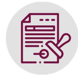
Licenses and permits related to construction processes