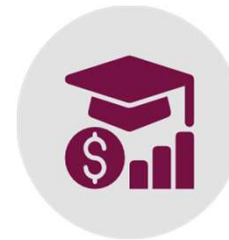
Promotion of education