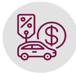
Acquisition of Used Motor Vehicles