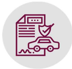
Vehicle Ownership or Use