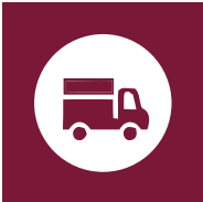
Transport & Storage